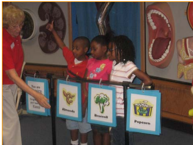
Students from L.C. Kerr Elementary School in Clinton, NC participate in Bones, Joints & Vertebrae...Oh My! at the Poe Center.